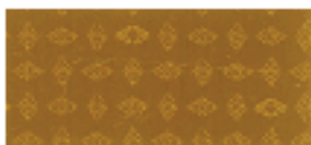
* School Bus Yellow 44