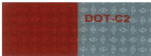
** Red/White 11"/7" & 6"/6"